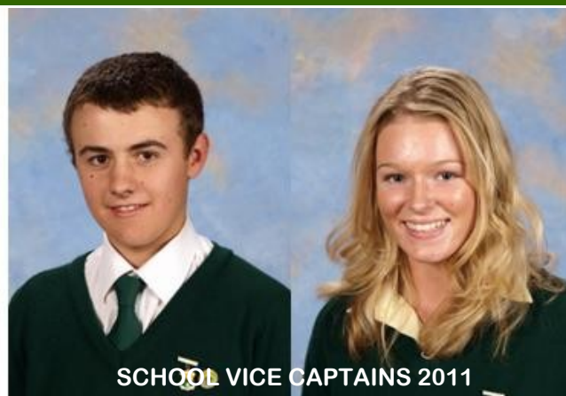
SCHOOL VICE CAPTAINS 2011