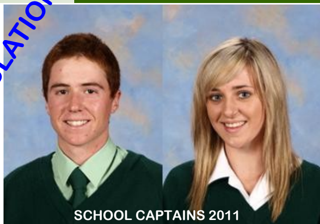
SCHOOL CAPTAINS 2011